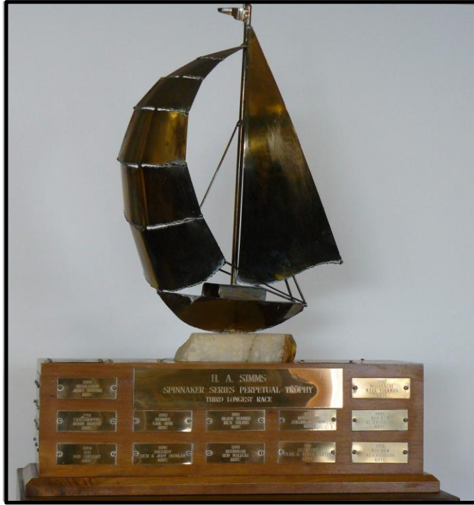
The H.A. Simms Perpetual Trophy PHRF A & B