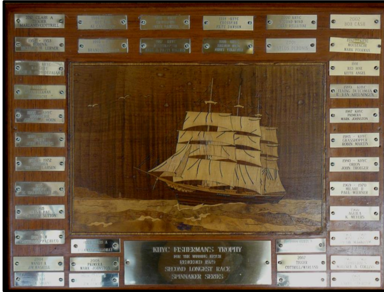
Fisherman's Perpetual Trophy PHRF A