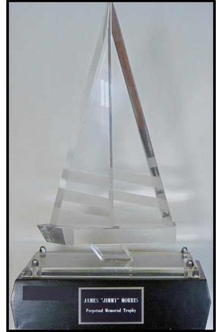
Jimmie Morris Perpetual Trophy PHRF B